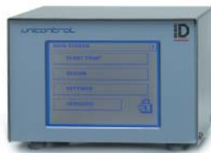
Standard 5.7" LCD touch screen Unicontroller