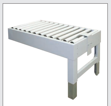
Long Exit Conveyor