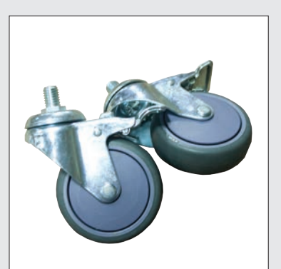
Locking Casters w/ Support Brackets