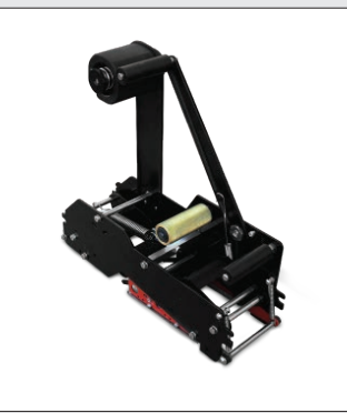
Spare Tape Head